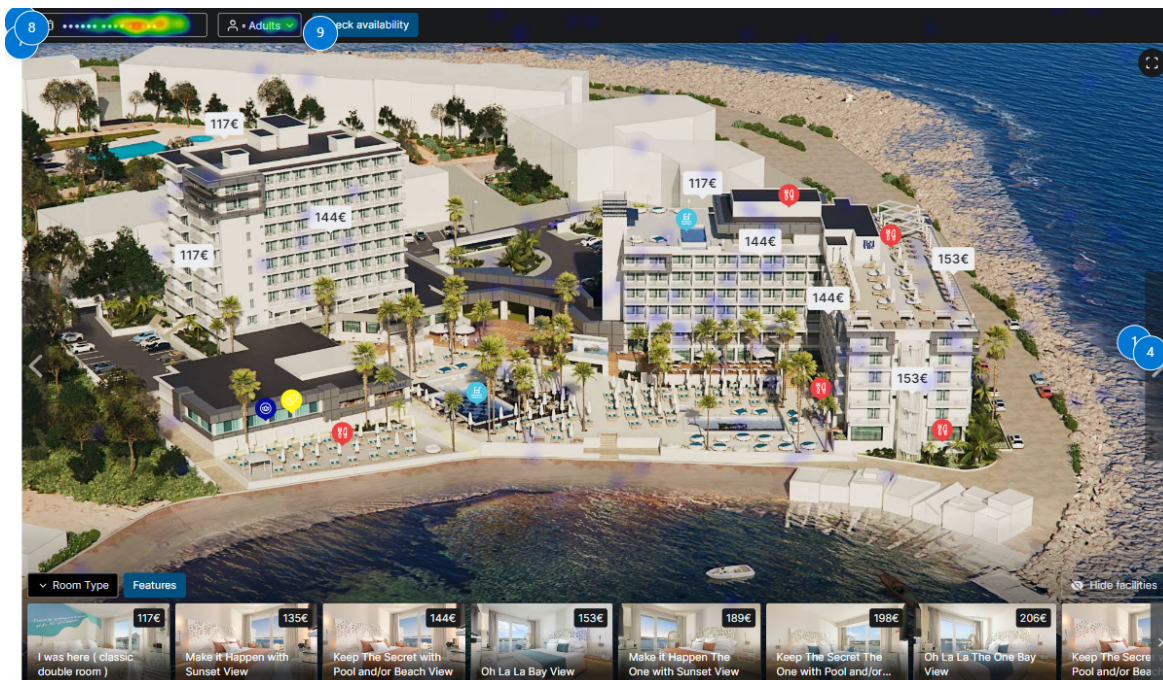
Heat map of user interaction with the Digital Twin - Amàre Beach Hotel Ibiza (Period: 22/09/2023 - 23/10/2023)