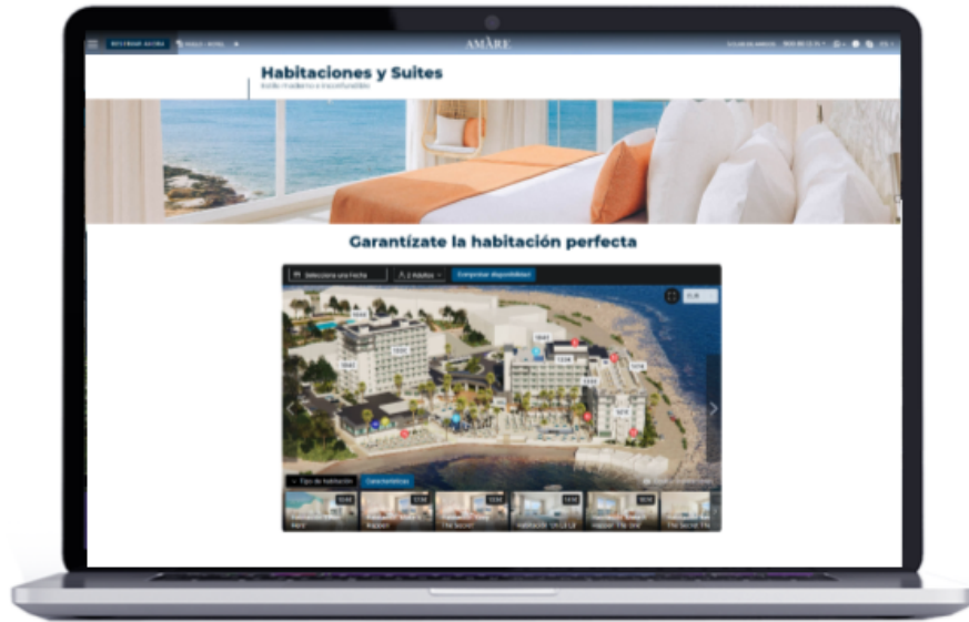
Visualization of the Hotelverse Digital Twin on the Amàre Beach Hotels website